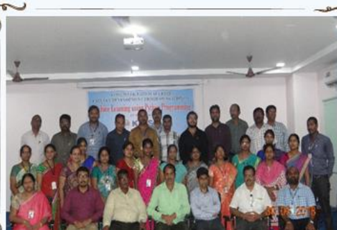
Group Photo during Valedictory Gathering

✓ The following members attended a Faculty Development Programmed on "AWs skill guru workshop", conducted at "VFSTR Deemed to be University Programme", and organized by APSSDC on 18th-19th June.